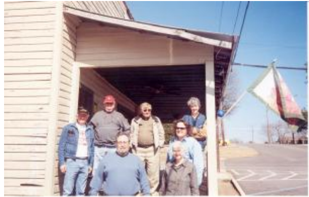
On the steps of The Wooden Nickel Cherokee, AL February 21, 2004

'63 MGB 6-wheeler at Boonshoft Museum in Dayton, Ohio Sept 2003.