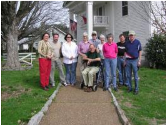
In front of Miss Mary Bobo's Lynchburg, TN March 20, 2004